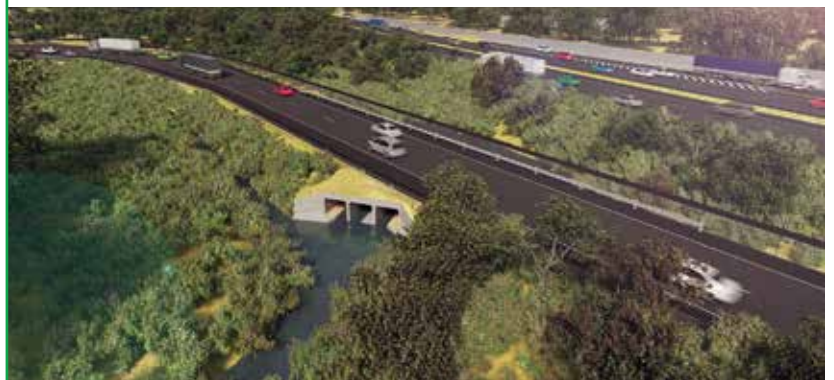
Image: Artist impression of the Wembley Road fauna crossing