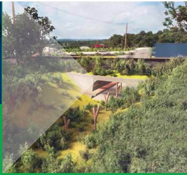
Image (top): Artist impression of the Beaudesert Road fauna crossing

Transurban Queensland, operator of the go via network , is committed to improving environmental outcomes for the local community through the Logan Enhancement Project.