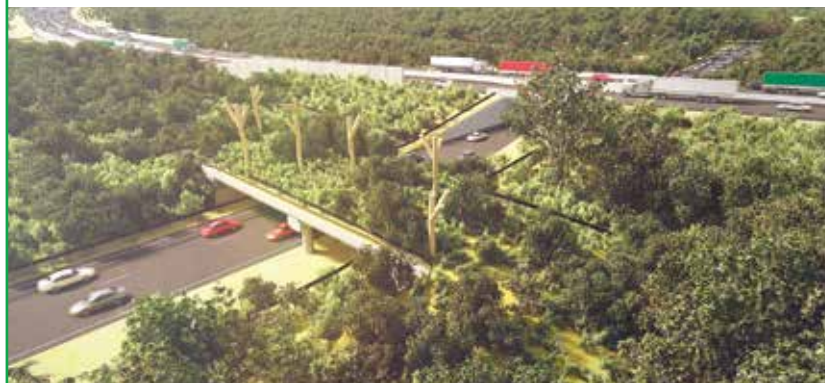
Image: Artist impression of the Illaweena Street fauna crossing

Transurban Queensland recognises the importance of this green belt and the environmental significance of the surrounding bushland and wetlands. To improve environmental outcomes of the project, Transurban Queensland formed an Environmental Reference Group (ERG), comprised of six local environmental groups, to consolidate views on how to best maintain and enhance fauna connectivity around the road network.